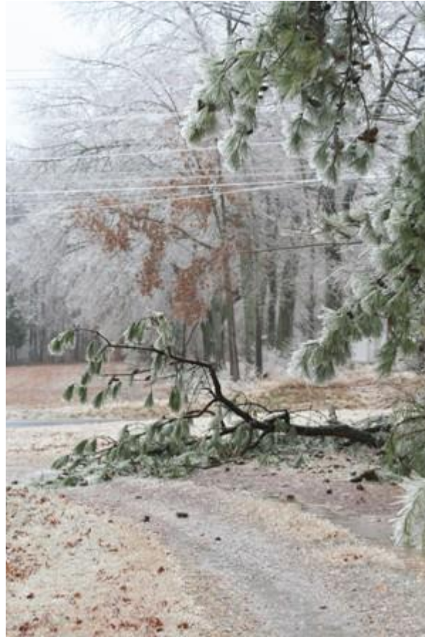
Photo below taken during the middle of the ice storm on Tuesday afternoon (near Paducah, KY)

Photo below taken during the middle of the ice storm on Tuesday afternoon (Murray, KY)