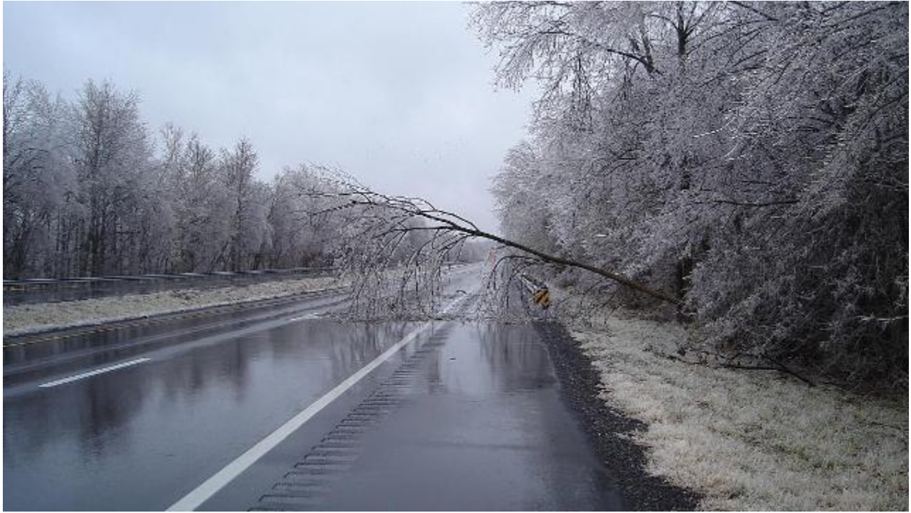
Photo below taken during the middle of the ice storm on Tuesday afternoon, Jan. 27

Photo below taken during the middle of the ice storm on Tuesday afternoon, Jan. 27. A tree blocked a lane of the Purchase Parkway in Fulton County, KY. Other major highways including Interstate 24 were blocked by trees.