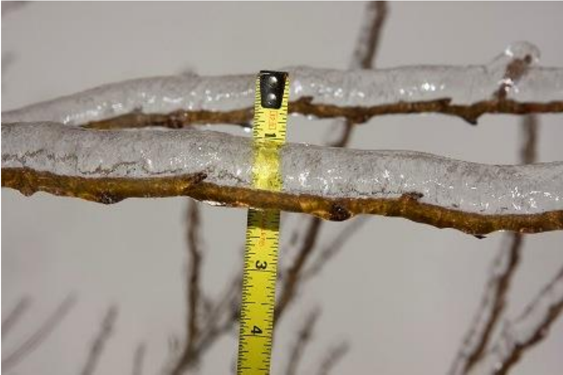
Photo below taken during the middle of the ice storm late Tuesday afternoon

Photo below taken during the middle of the ice storm on Tuesday afternoon