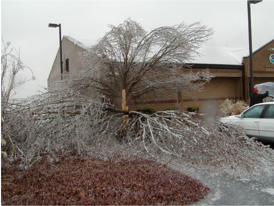
Photo of the National Weather Service office in Paducah (below) taken during the middle of the ice storm on the afternoon of the 27th. Trees in front of the office were heavily damaged.

Below is a photo taken immediately after the ice storm (early on the 28th), looking across the street from the Paducah NWS office.